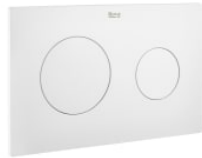
PL10 DUAL - Dual flush operating plate for concealed cistern with matt finishes