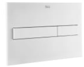
PL7 DUAL - Dual flush operating plate for concealed cistern