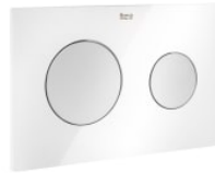
PL10 DUAL - Dual flush operating plate for concealed cistern