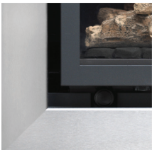
Brushed Chrome Code: A6