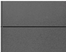
Black Liner Code: B3

Note: The inspire 400 model is only available with a choice of black, mirrored glass & vermiculite.