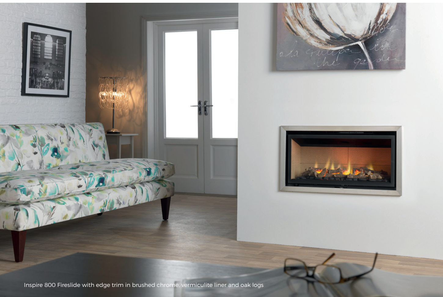
Inspire 800 Fireslide with edge trim in brushed chrome, vermiculite liner and oak logs

For the ultimate in convenience all fires in the Inspire collection also come with Valor's unique Fireslide control, a first of its kind for premium gas fires. Plus the 500, 600, 800 and 1000 models are also support the option for an advanced remote control which offer a wider host of features.