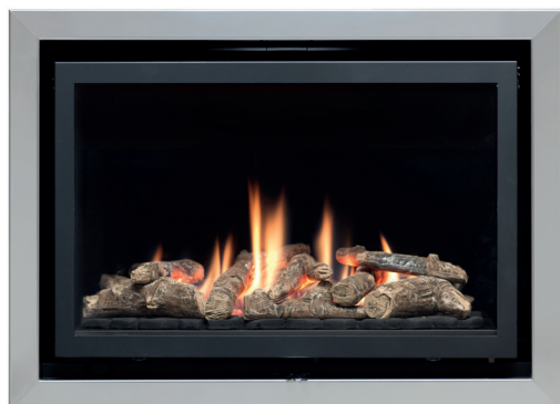
Fireslide or remote control