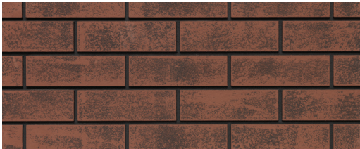
Brick Liner Code: B4