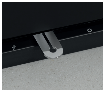
Fireslide control chrome