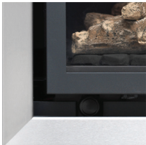
Brushed Chrome Code: A2