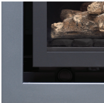
Anthracite Code: A3