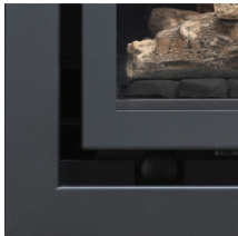
Black Code: A4