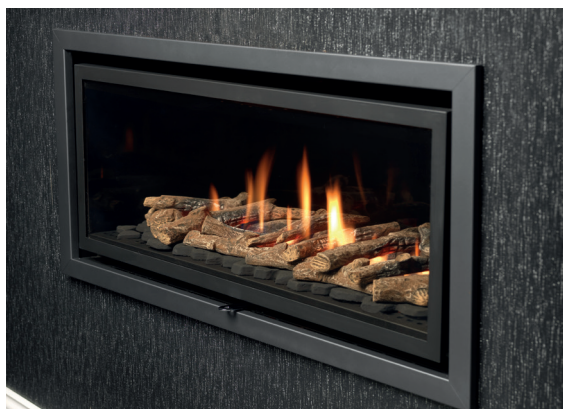
Fireslide control chrome