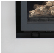
Chrome Code: A5