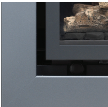
Anthracite Code: A7