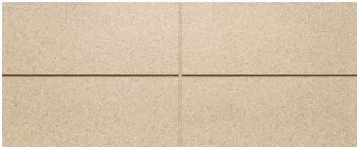
Vermiculite Liner Code: B2