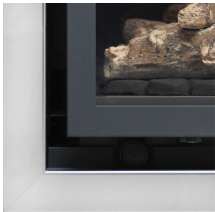
Chrome Code: A1