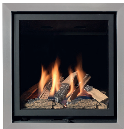
Fireslide or remote control