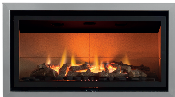
Fireslide or remote control