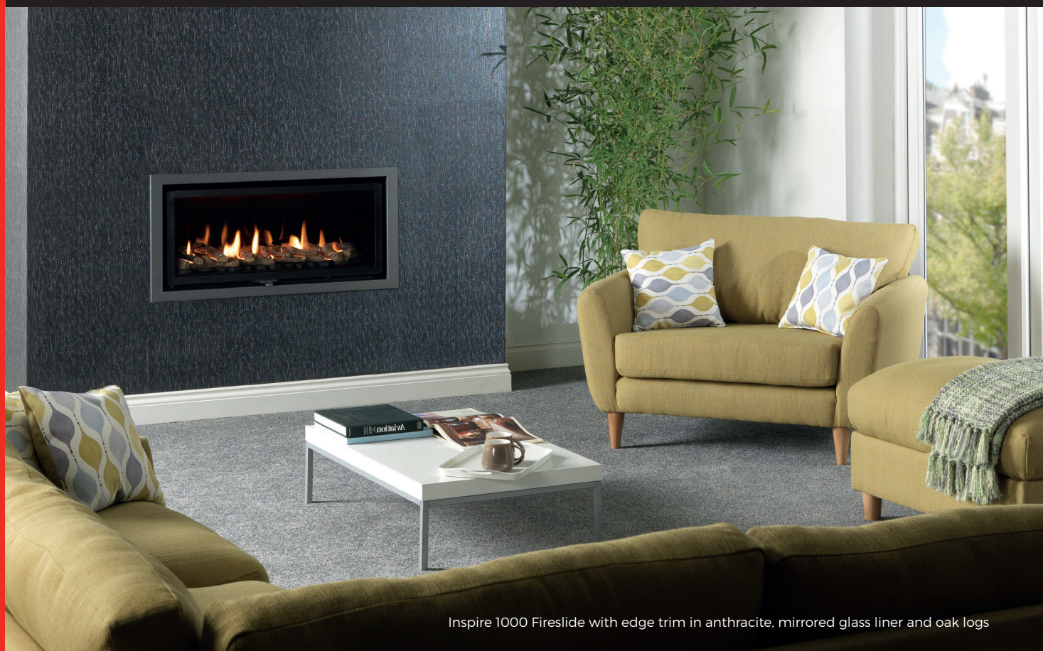
Inspire 1000 Fireslide with edge trim in anthracite, mirrored glass liner and oak logs