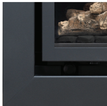
Black Code: A8

Note: The Inspire 400 model choice of a 3 sided or 4 sided trim available in the above design and finish.