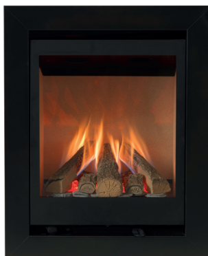
Luminaire LED Technology