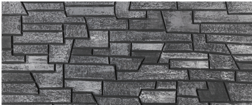
Slate Liner Code: B4