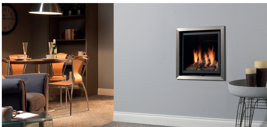
Luminaire LED Technology